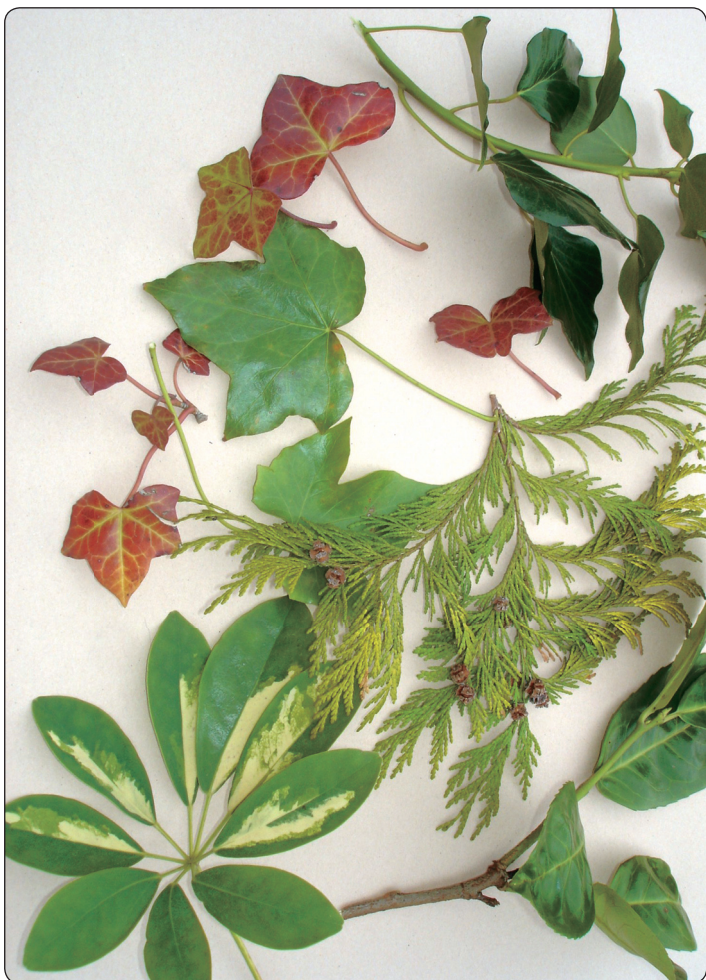
Leaves for rubbings