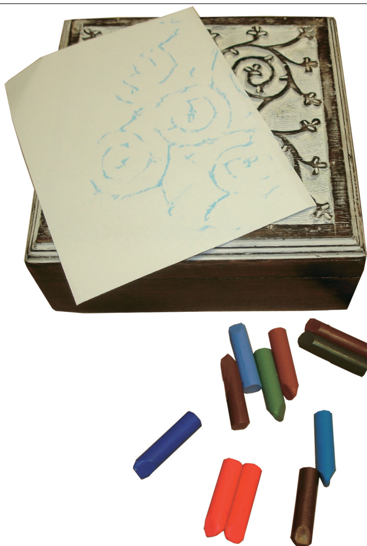
Resources for rubbings